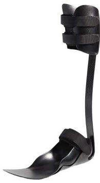
Carbon AFO (dynamic)