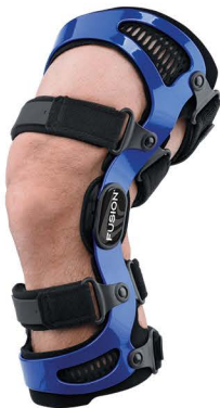
Knee ligament brace