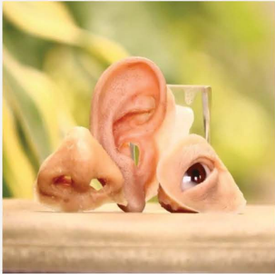
Eye ear nose prosthesis