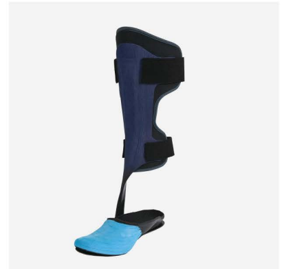
AFO with Filler