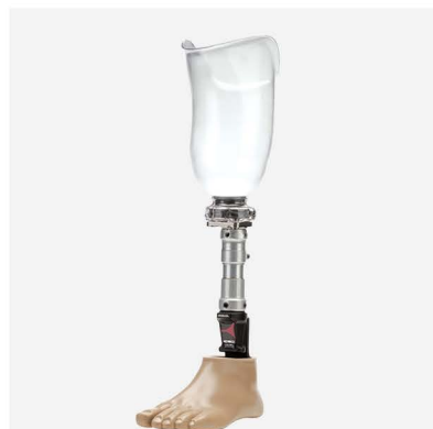
Below knee Prosthesis