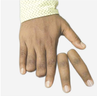
Silicon Finger Prosthesis