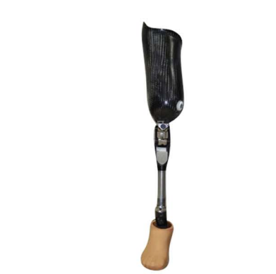
Above knee Prosthesis