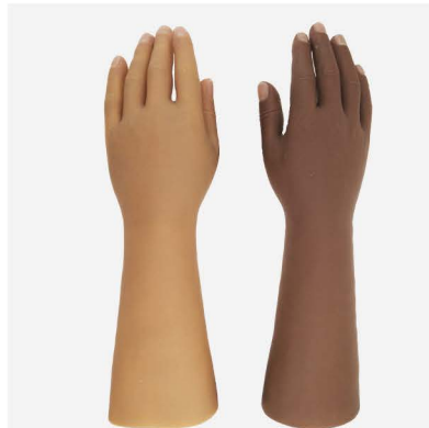
Silicon gloves Prosthesis