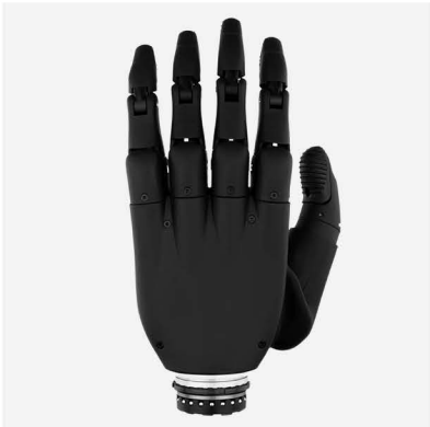
Bionic Prosthetic hand