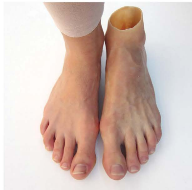
Partial Foot Prosthesis