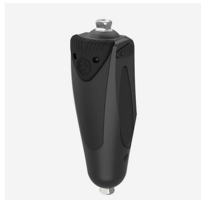
Hydraulic knee joint